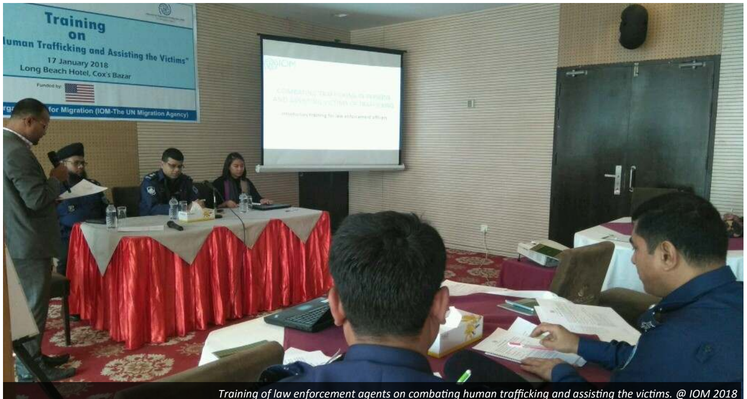
Training of law enforcement agents on combating human trafficking and assisting the victims.

During the past week, IOM responded to 159 Protection/Gender-Based Violence (GBV) cases. Overall, IOM has identified 15,151 extremely vulnerable individuals and 447 GBV cases have been assisted through IOM's case management. Additionally, 4,153 individuals have received Psychosocial First Aid and 24 Victims of Trafficking (VoTs) have been identified and assisted.