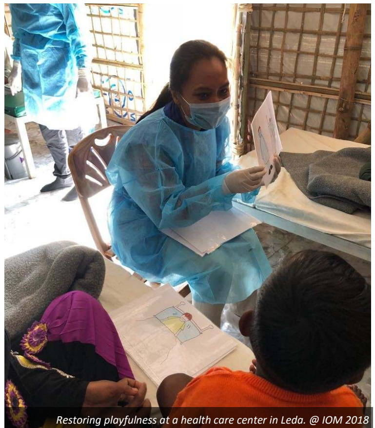
Restoring playfulness at a health care center in Leda. @ IOM 2018

The Mental Health and Psychosocial Services (MHPSS) unit organized a training for 15 health staff , including doctors and nurses. The training aimed at including psychosocial basic support into the general process of admission of patients into DTCs . The training included basic psychosocial skills such as active listening, circular questioning, self-care and systemic approach to understand families.