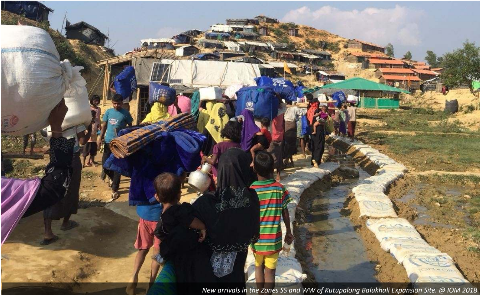
New arrivals in the Zones SS and WW of Kutupalong Balukhali Expansion Site.