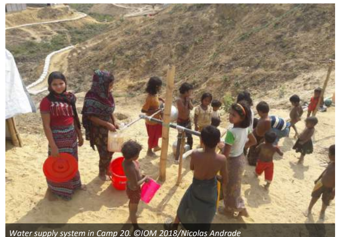
Water supply system in Camp 20.

The water supply system in Camp 20 is now functional ; two 5000-liter capacity bladders were installed with six taps each. Additionally, hand pump fixing is ongoing.