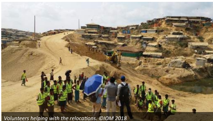
Volunteers helping with the relocations.

In Camp 9, 18 Focus Group Discussions (FDGs) were facilitated in high risk areas with the support of the Safety and Security Committees. Another 79 community meetings were organised to discuss WASH concerns, the distribution schedule of Upgrade Shelter Kits, CFM and DRR awareness. Additionally, a community meeting with landowners, shop managers, implementing partners and majhees on unsafe pits in private lands with shops and other structures along the pathways in the camp has held; the area was immediately fenced.