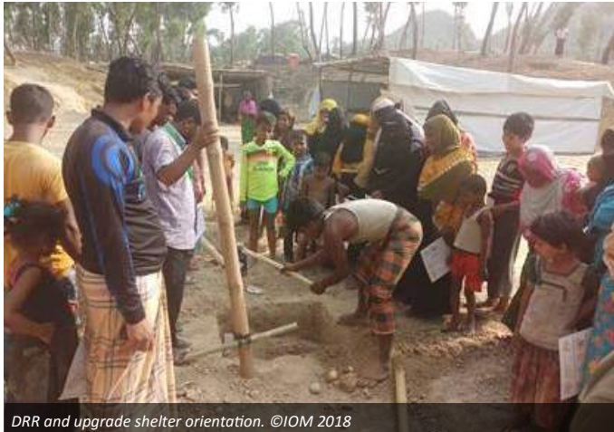
DRR and upgrade shelter orientation.

During the reporting period, IOM distributed 2,427 Upgrade Shelter Kits (USKs) in Camps 8E, 8W, and 9 and provided shelter upgrade and Disaster Risk Reduction (DRR) orientation sessions to 5,577 households in Camps 8W, 9, 10 and Leda Makeshift Settlement. Since 3 February 2018, IOM has distributed USKs to 24,050 households and provided shelter