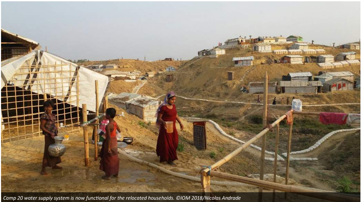
Camp 20 water supply system is now functional for the relocated households.