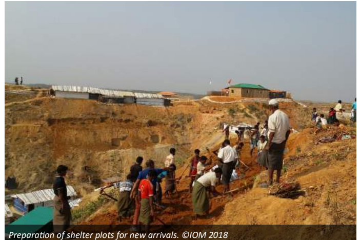
Preparation of shelter plots for new arrivals.

community . IOM and its partners continue to scale up operations to respond to the needs of new arrivals, existing Rohingya, and affected host communities.