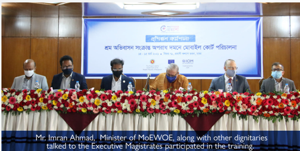
Mr. Imran Ahmad, Minister of MoEWOE, along with other dignitaries talked to the Executive Magistrates participated in the training.