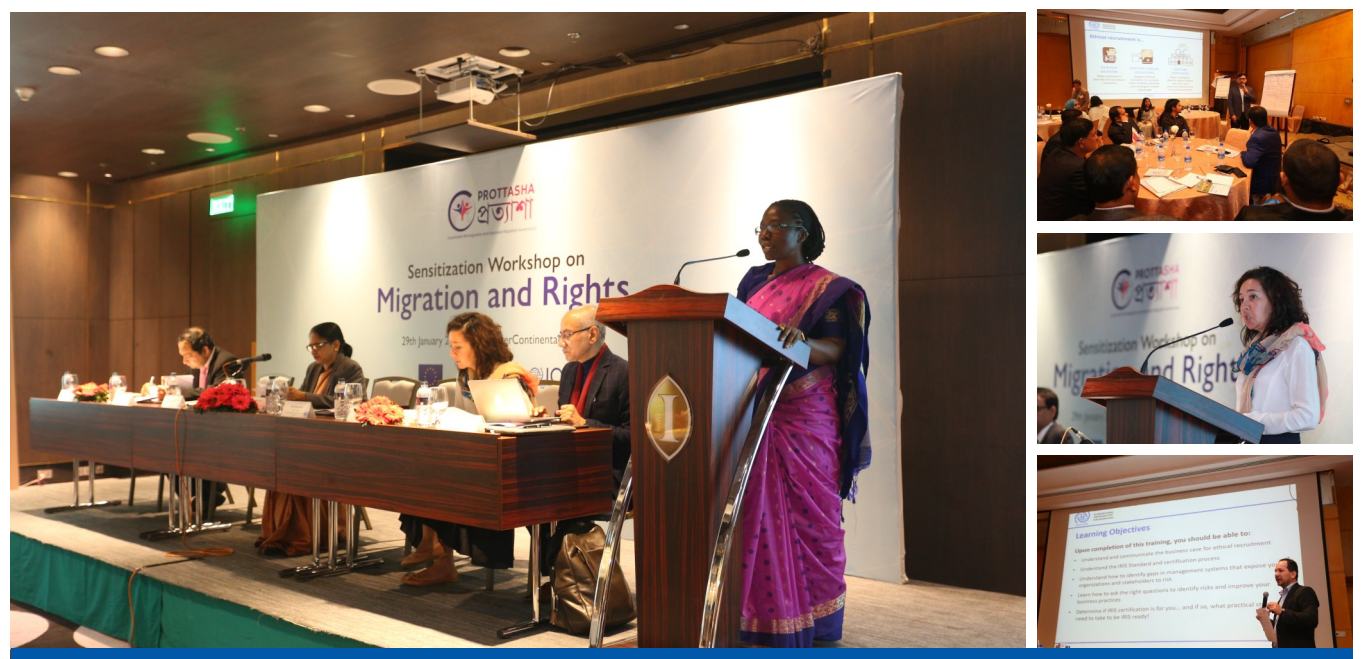
In January 2019, recruitment agencies were sensitized on ethical recruitment practices and trained on International Recruitment Integrity System (IRIS).